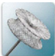
One type of Septal Occluder

A Septal Occluder is passed into the fine tube and advanced through your heart and put into the defect.