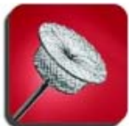
One type of Septal Occluder

A Septal Occluder is passed into the fine tube and advanced through your heart and put into the hole.