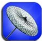
One type of Septal Occluder

A Septal Occluder is passed into the fine tube and advanced through your heart and implanted into the septal defect.